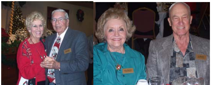
Holiday Happiness at the Phoenix Club.